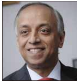
Sabaratnam Arulkumaran UK "Preeclampsia and Eclampsia the Evolution and Current Status"